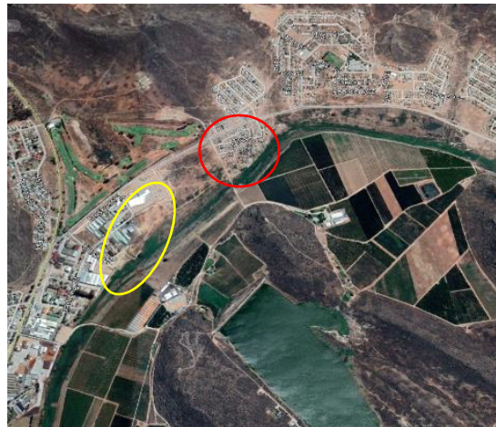
Fig. 4: Expansion of infrastructure and Asbury closer to the Kingna River by 2018