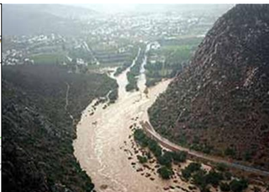
Fig. 2: Flooding at the entrance of Montagu in 2003