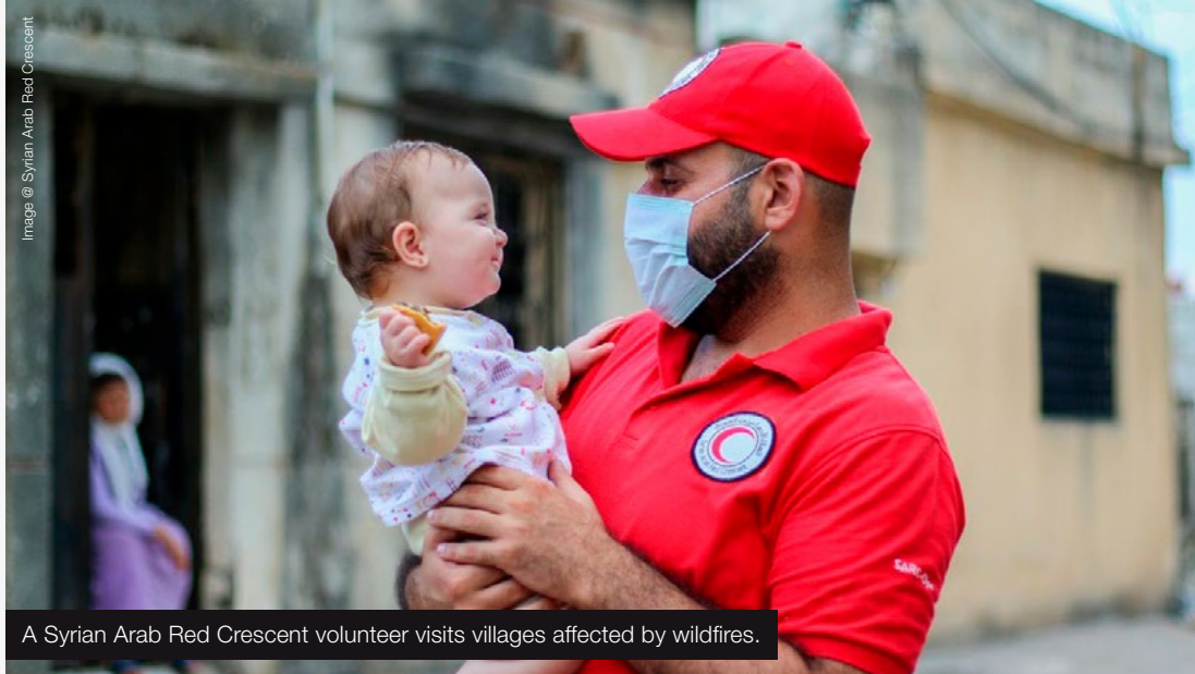
A Syrian Arab Red Crescent volunteer visits villages affected by wildfires.

Adopting anticipatory action (AA) approaches as part of national disaster risk management systems is therefore crucial. However, refugees and internally displaced people (IDPs) are often left out of existing efforts.