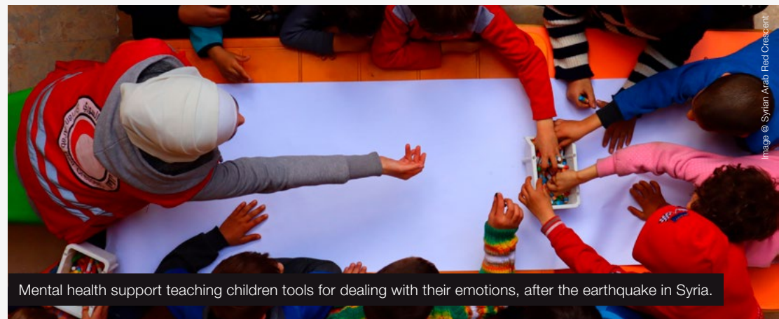
Mental health support teaching children tools for dealing with their emotions, after the earthquake in Syria.