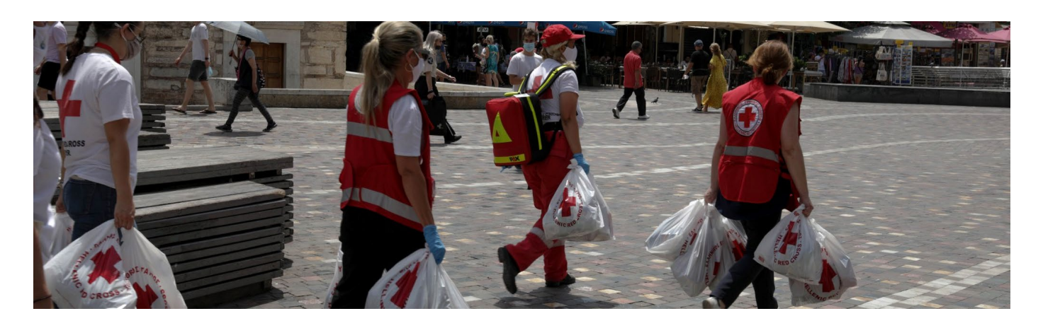
Hellenic Red Cross (HRC) volunteers distributing water in Athens during a heatwave in July 2022.