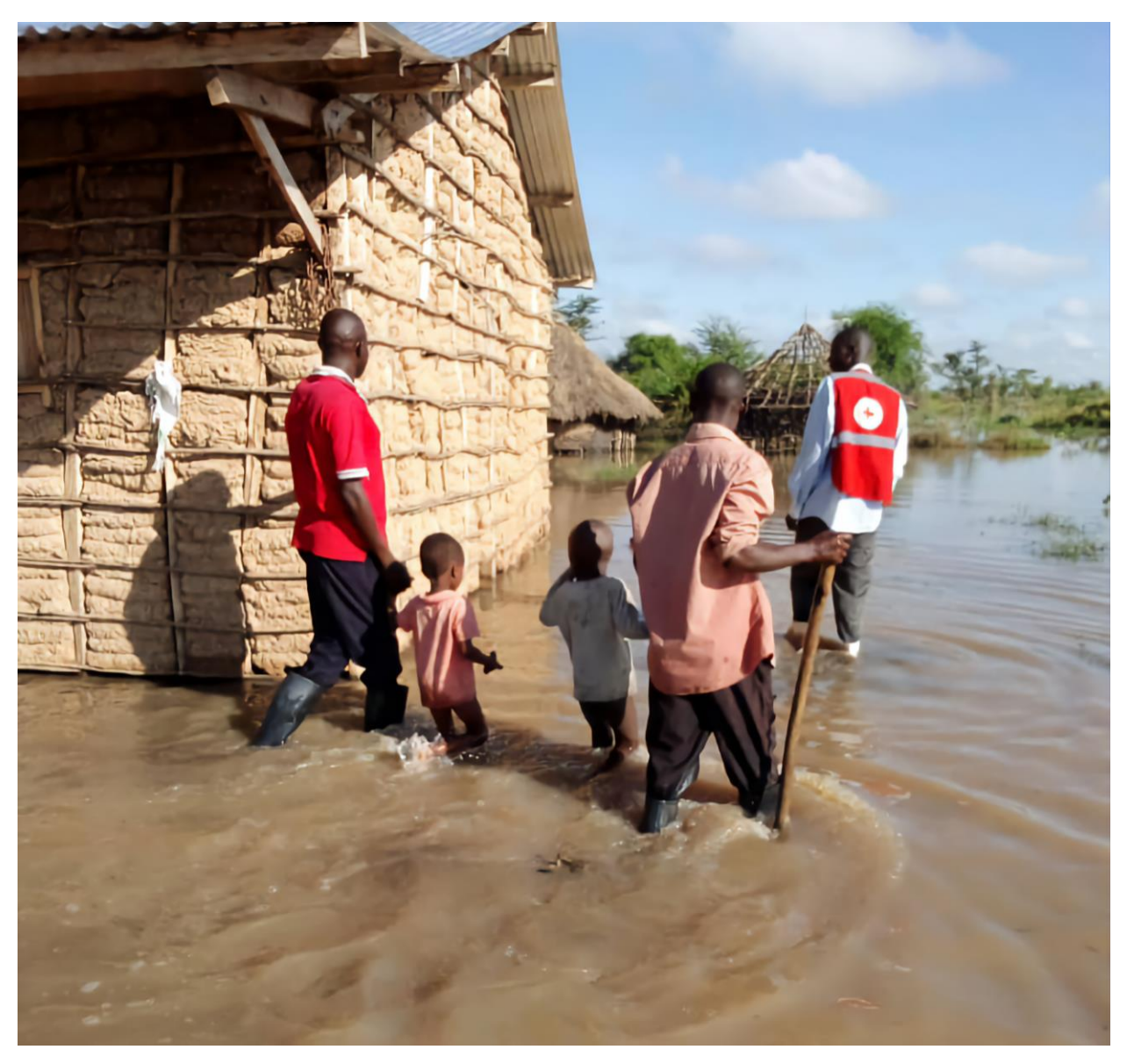
Uganda Red Cross Society, volunteers rescuing children amidst increasing fear of Extreme flood event