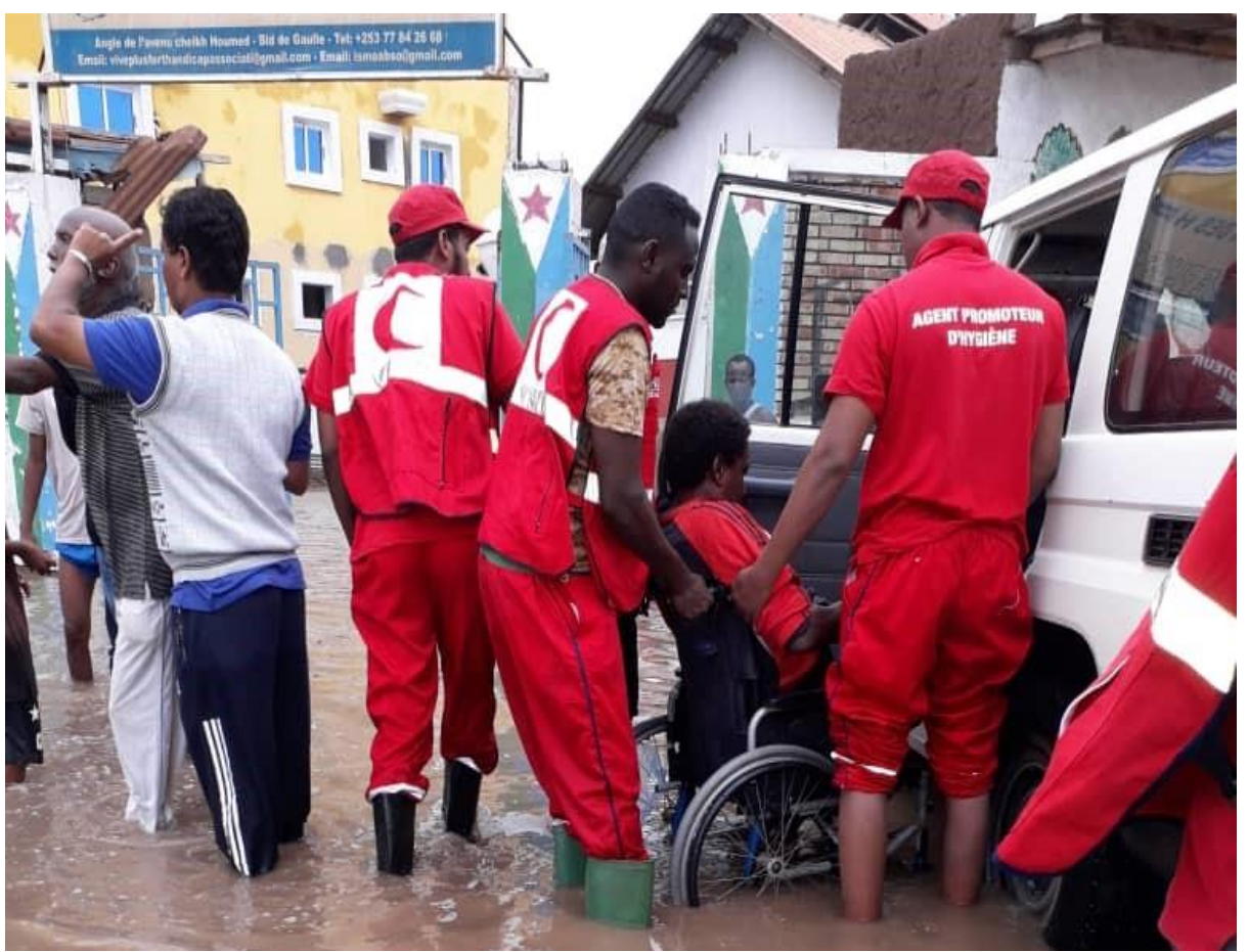
Rescue operation by Djibouti Red Crescent underway