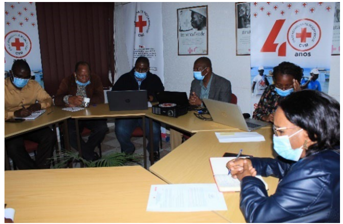
Picture 2: First meeting on activation after receiving DNGRH forecast