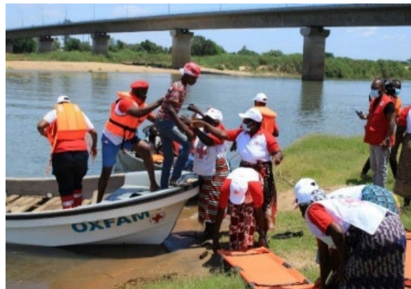
Picture 4 and 5: Search and rescue operation in the Caniçado neighborhood