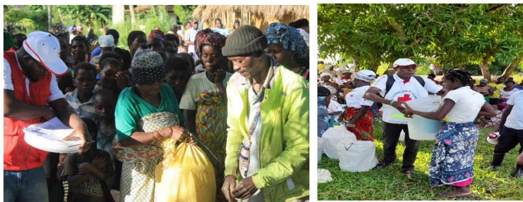
Picture 10 and 11: Distribution of NFIs in Maganja Da Costa district, during March re-activation

The re-activation reached 1,477 families in three communities (Nate sede, Mugoloma e Mamiua) in the district of Maganja da Costa, administrative post of Nante (Zambézi province). For this activation, CVM mobilized 115 volunteers, 4 technicians from CVM HQ (EAP Droughts Manager, PMER, WASH Technician and Information Officer) and Provincial Delegation (Provincial Secretary, Provincial Administrator, Provincial Healthy Technician, Disaster Risk Reduction Technician, Provincial President, and General President of CVM) and other partners including INGD, UNAPROC, IFRC.