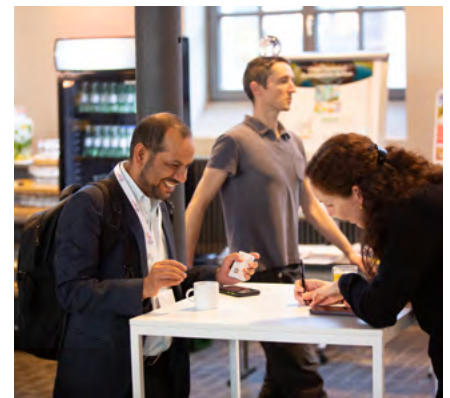
The best juggler in Berlin.