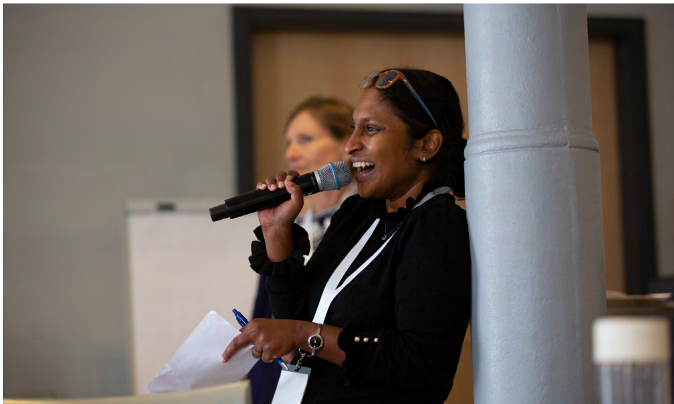
Discussions on day two at the 12th Global Dialogue Platform.

Research on the 2021 floods in Germany found that an inability to imagine the scale of flooding hampered preparations and led to devastating impacts. This wild card session considered the role of imagination in helping us to anticipate complex crises, exploring both scientific and creative methods to help us imagine unknown futures.