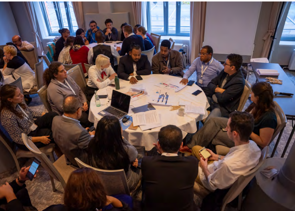
Group discussions during the parallel sessions.

How should we design anticipatory action in a changing climate? The final wild card session was a chance to explore different ideas.