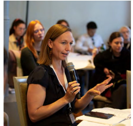
Discussions during one of the parallel sessions.

You can rewatch many of the parallel sessions on the event website: tinyurl.com/yrsyytnh