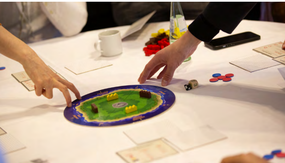
Games are an effective way to explain anticipatory action.

Hotel Resilience is a game about risk prevention, reduction and transfer, during which players take the role of hotel managers on an island that is frequently hit by tropical storms. They have to manage resources, expand their business and protect themselves against natural hazards by investing in DRM measures, such as early warning systems or index insurance. This session introduced some new elements to the game that allow players to use anticipatory action to mitigate the impacts of storms.