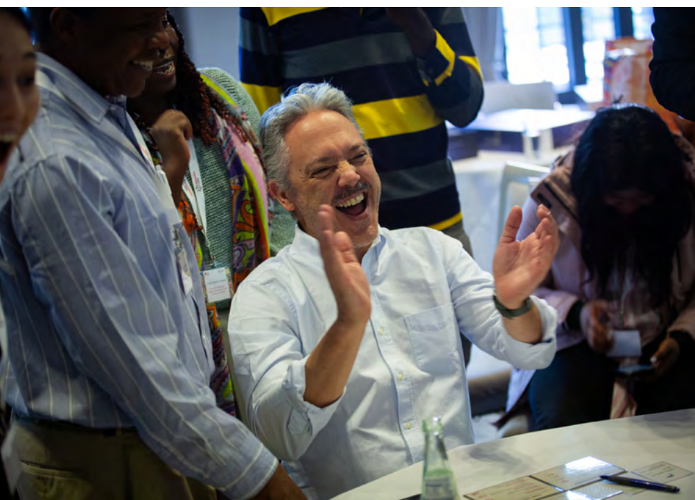
There was plenty to enjoy across the three days.

Public health emergencies, such as disease outbreaks, pose a major burden in many countries. For some health crises, information and insights are available before their onset; these can inform actions and make it possible to prevent and/or reduce acute humanitarian impacts before they fully unfold. This interactive workshop invited participants to learn how to develop anticipatory action frameworks for health impacts that may emerge slowly over time as protracted crises, or suddenly and acutely. Participants learnt about new tools and guidance, and grappled with the multiple layers of health-risk information in time and space.