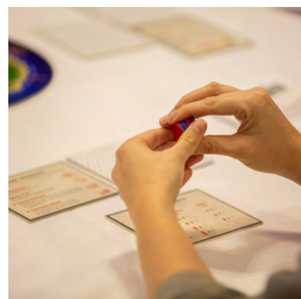
Fun and games at the 12th Global Dialogue Platform.

In the second wild card, participants in Berlin got to play-test an exciting new game, developed by the Red Cross Red Crescent Climate Centre, which aims to enhance discussions about memory and preparedness for unseen risks.