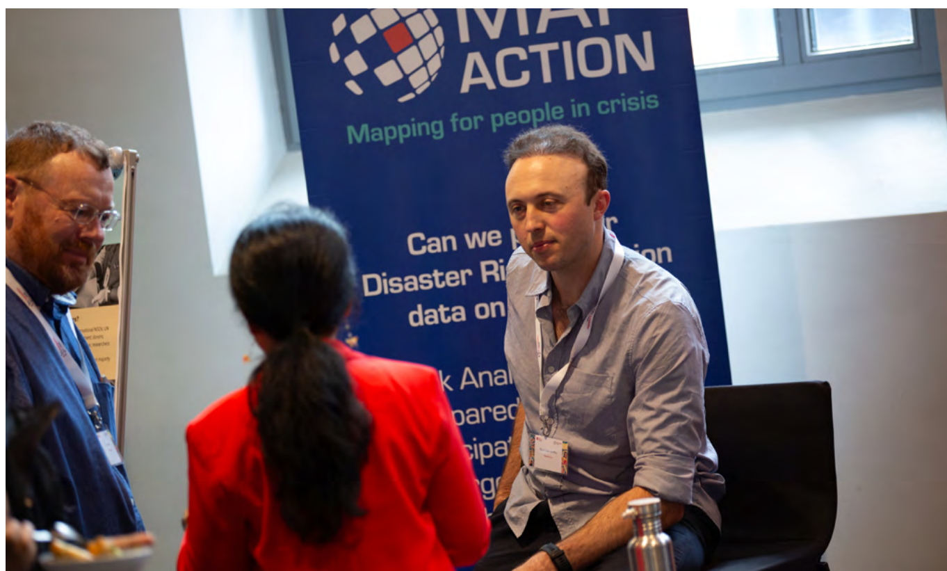
Exhibition stalls were open during the breaks and the parallel sessions so that participants in Berlin could learn more about some of the projects taking place worldwide.

Despite growing recognition of the need to integrate protection, gender and inclusion into anticipatory action, implementation remains inconsistent and often lacks capacity, resources and monitoring mechanisms. This workshop saw the launch of a recently developed toolkit, which synthesizes three years of dialogue and collaboration and provides practical guidance to ensure inclusive and protective practices. During the workshop, the presenters emphasized the need for people-centred approaches, as well as collaboration and learning among local, national and international actors.