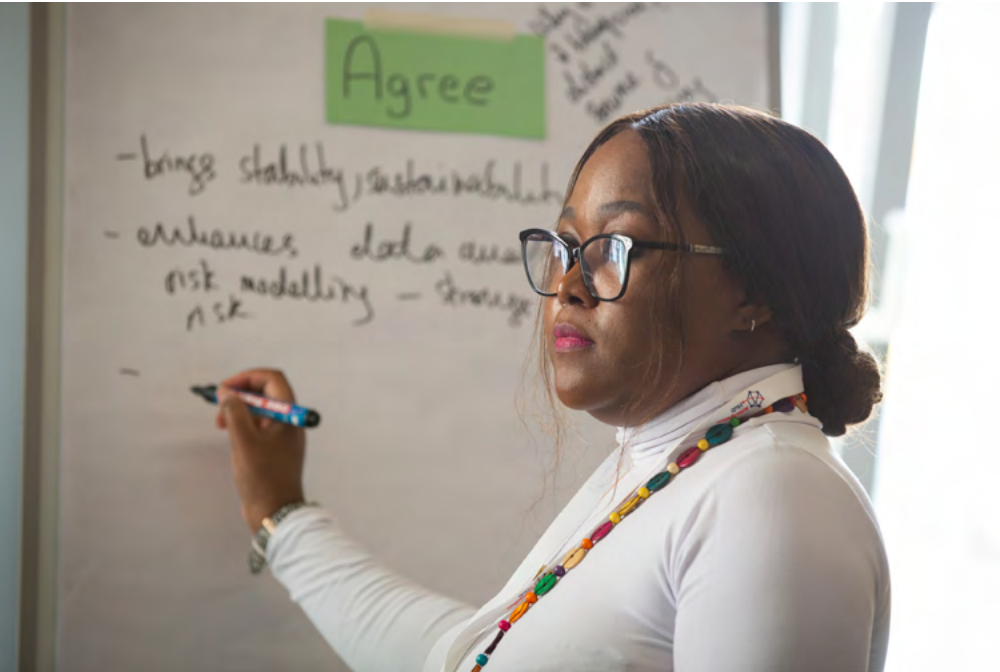
There was plenty to take in during the parallel sessions.

We all have ambitions for what a perfect world would look like – but what would an ideal ‘disaster-prepared’ world look like? This wild card session was a space to discuss how we can mainstream anticipatory action into our DRM systems and create our ‘perfect’ world.